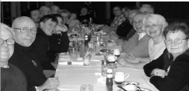
Valentine Day dinner at Carriage Corner in Mifflinburg